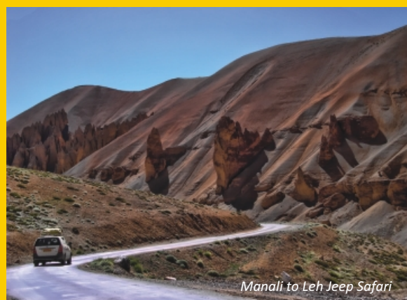
Manali to Leh Jeep Safari

The Manali (Himachal Pradesh) to Leh (Ladakh) road is open only for 2-3 months, between July and September, every year before the snows cover it up or wash away the road. This overland route has become an increasingly popular way to go to Leh. This overland road safari is an unforgettable experience as the road traverses a variety of landscapes and one can hardly put the camera away. Along the way nature impresses with awesome mountain passes of 17-18,000 ft., long stretches of flat, cold desert without a trace of vegetation, amazing natural rock formations and deep gorges of the rivers Beas, Chandra, Bhaga and finally Indus.