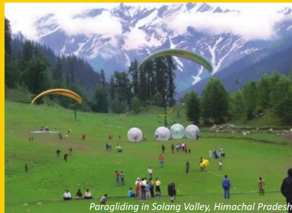
Paragliding in Solang Valley, Himachal Pradesh

It is a hub for adventure seekers. There are various treks ranging from soft to strenuous along with options for skiing, heli-skiing, paragliding, mountaineering, rock climbing and biking. For soft adventures, there are many overland tours in Kinnaur and Lahaul & Spiti.