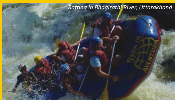
Rafting in Bhagirathi River, Uttarakhand

The Indian Himalayas have some of the best rivers in the world. Our River running trips in India takes you way off the beaten tourist trail.