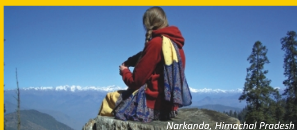
Narkanda, Himachal Pradesh

Popularly known as the Devbhumi – "Land of the Gods", Himachal Pradesh is a beautiful hill state in northern India nestled in western Himalayas. The state is landlocked with the Tibetan plateau to the east, Jammu and Kashmir to the north, and the Punjab to the west. However the state stands apart from its neighbours in terms of its sheer topographic diversity and breathtaking pristine natural beauty.