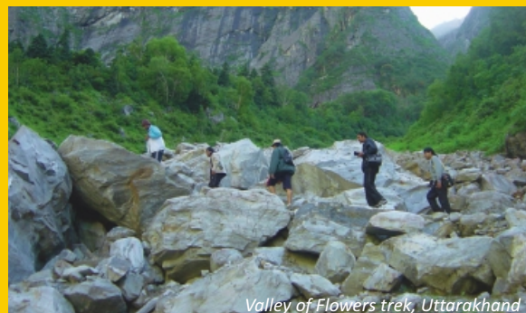
Valley of Flowers trek, Uttarakhand

With the Himalayas spanning across India's entire 2500 kms northern border, the scope for trekking in India is almost endless. The huge variations in altitude and latitude create many different climates giving us a twelve month trekking season. We offer trips for all levels of ability, from low altitude routes with short walk times, to 6000 m peak ascents and long glacial traverses. Itineraries vary in length from five to fifteen day expeditions, passing through some of the most beautiful scenery in the world.