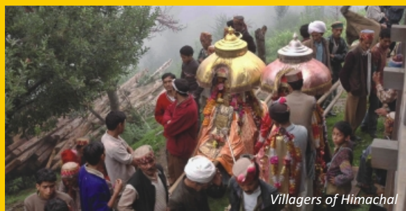
Villagers of Himachal

From the unique Buddhist culture of Ladakh, Lahaul & Spiti, to the ancient Hindu villages of Himachal Pradesh and Uttarakhand, a wide variety of people inhabit the highlands of India. Our treks, safaris and river expeditions bring you face-to-face with these cultures for a chance to interact with them. This interaction enriches your travel experience with an insight into the life, faith, lifestyle and cultures of these simple hill folks.