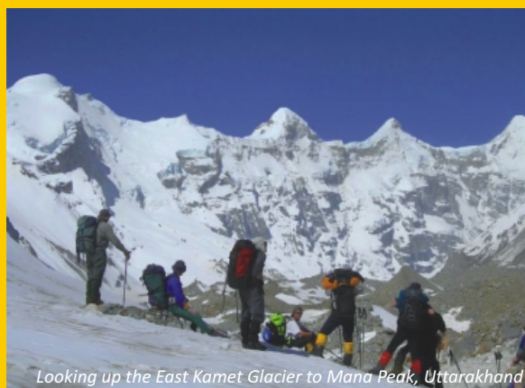
Looking up the East Kamet Glacier to Mana Peak, Uttarakhand

Uttarakhand has predominantly Hindu culture, all the main Hindu shrines such as Gangotri, Yamunotri, Kedarnath and Badrinath are in Garhwal Himalayas of Uttarakhand. Traditionally, pilgrims have been visiting these shrines deep into the valleys since ages. The holy river 'Ganges' finds its source from the Gangotri glacier which is completely enclosed by a concentration of peaks like Bhagirathi, Chaukhamba, Kamet, Kedar Dome and many others in the Garhwal region of the state. The mysterious lake of Roopkund, sacred peak of Nanda Devi (highest peak completely in India standing at 7802 m) and the huge massif of Trishul are in Kumaon region of the state.