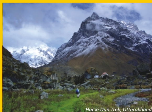
Har ki Dun Trek, Uttarakhand

Mythology seeps out of every pore of Uttarakhand. It has been a land of adventures and has attracted explorers since long. It offers thrilling rafting run down rapids of Bhagirathi, skiing down the slopes of Auli and some extremely challenging treks over passes such as Kalindi Khal, Lamkhaga pass or over the Trails pass. For people with moderate proclivities, it also offers some soft to moderate treks such as Kuari Pass, Milam glaciers or Chopta valley. For wildlife enthusiasts, there are sanctuaries such as Jim Corbett National Park and Rajaji National Park.